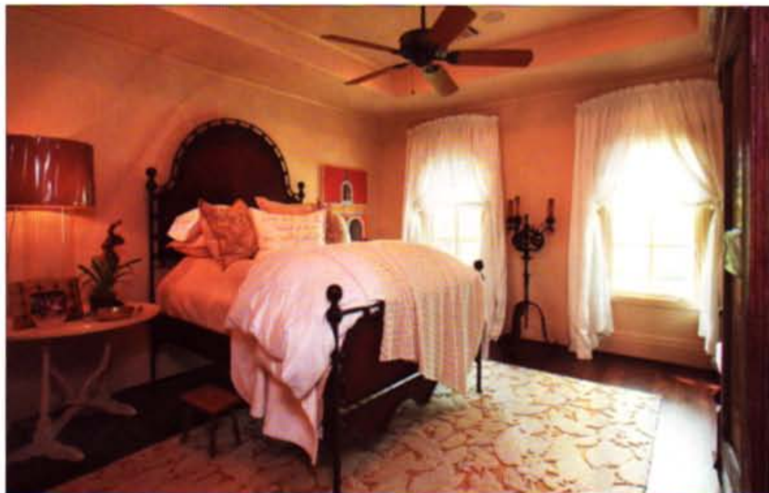
The Jan Barboglio bed is the focal point of this guest room, which is grounded beautifully by the textured rug and complemented by the draperies and art. Guests enjoy the amenities of this beautiful bathroom, especially the elegantly tiled wall, antique sink stand and ornately carved mirror.